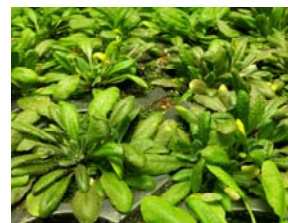
Normal temperature - normal light

Establishing a long-lasting cooperation between the Swiss and the Bulgarian partners