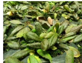
Low temperature - high light