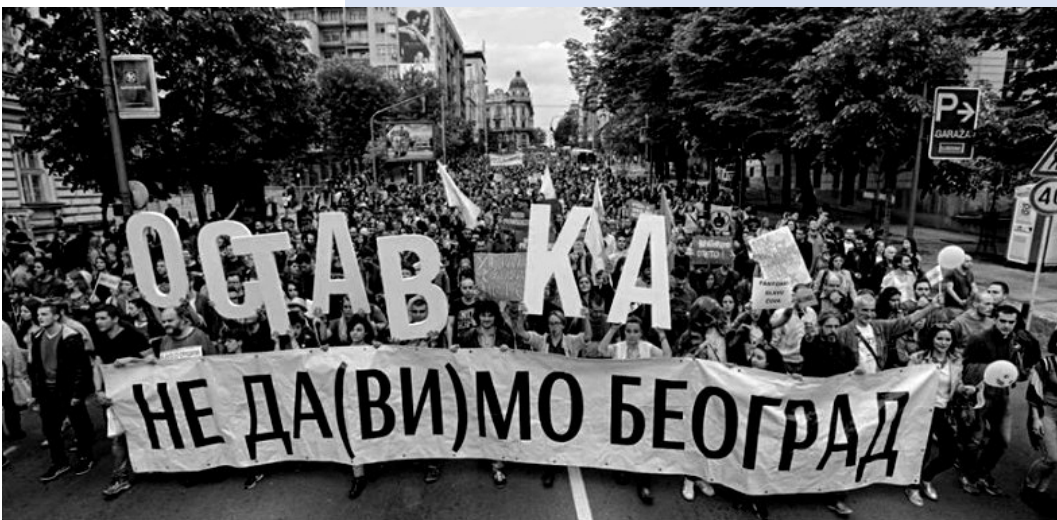
Project Dolenc - Disobedient Democracy