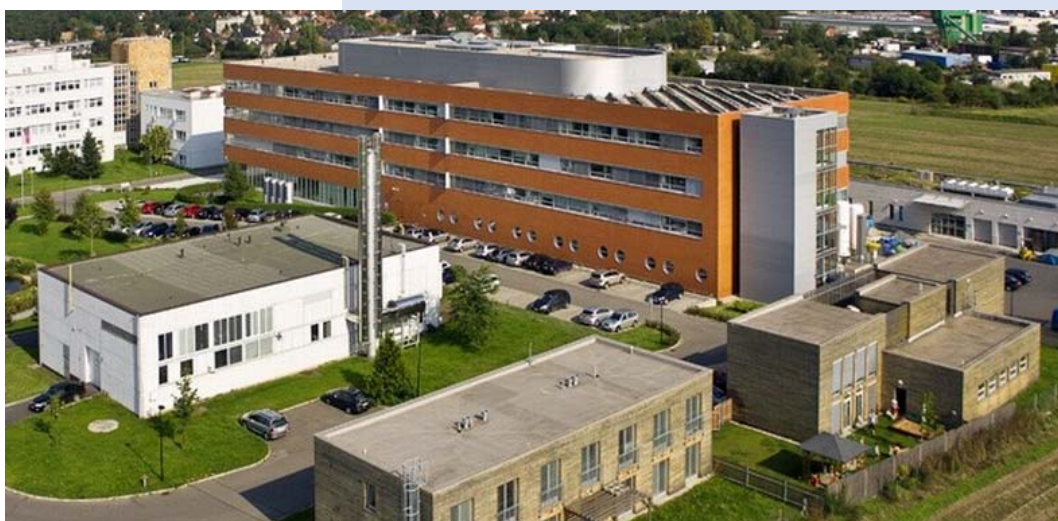
Project Stepanek - Institute of Molecular Genetics, Prague