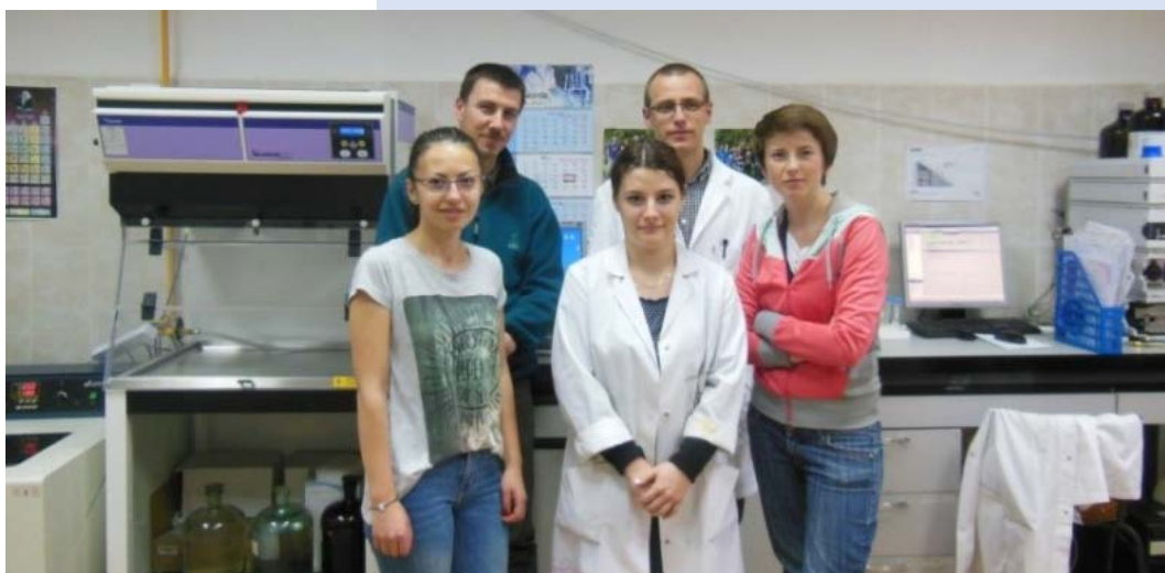
Project Bencze - MIO-enzyme toolkit for the synthesis of unnatural amino acids