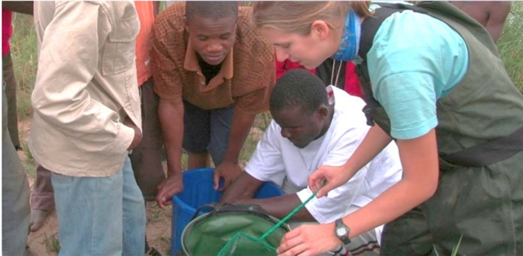
Project Musilová - Evolution of vision, smell and taste in fishes